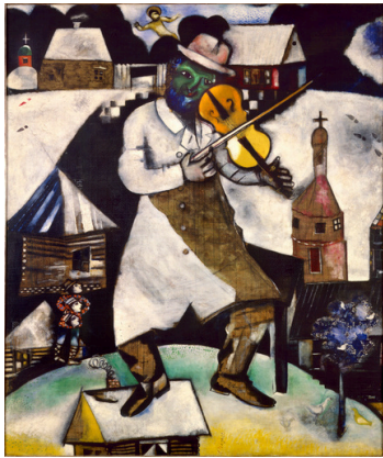
THE FIDDLER, 1913, MARC CHAGALL

The show's Director/Choreographer Jerome Robbins, born Jerome Wilson Rabinowitz, was introduced to the work of French/Russian painter Marc Chagall as a boy on a trip to visit his grandparents in Russia. In 1958, while in Europe, Robbins took a detour to his grandparents' shtetl in Russia. He found that the entire Jewish population had been wiped out by the Holocaust. There was nothing left. "To realize this was gone forever...this affected him greatly," noted Harold Prince, the show's producer.