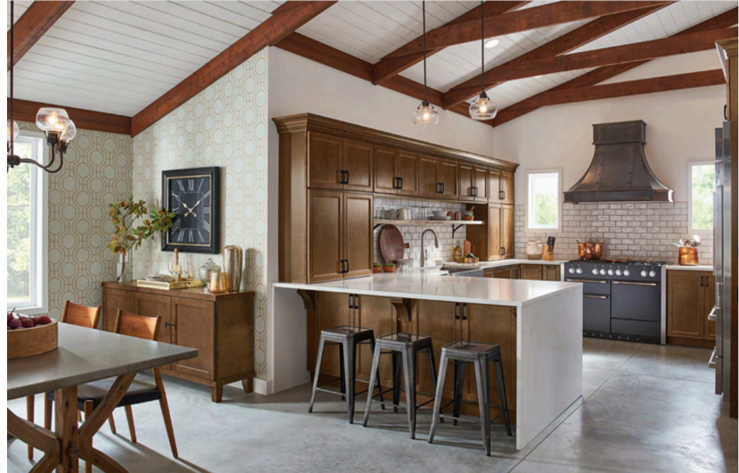
FEATURED STYLE: 540 Maple Truffle with Matte Black Rectangular Pull